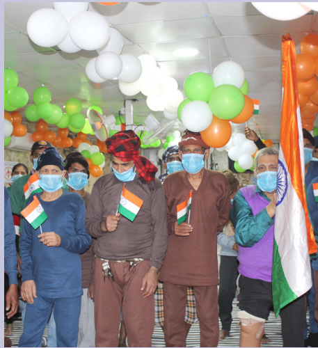
Republic day celebration