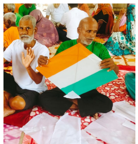
Independence day celebration