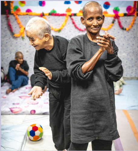
New year celebration